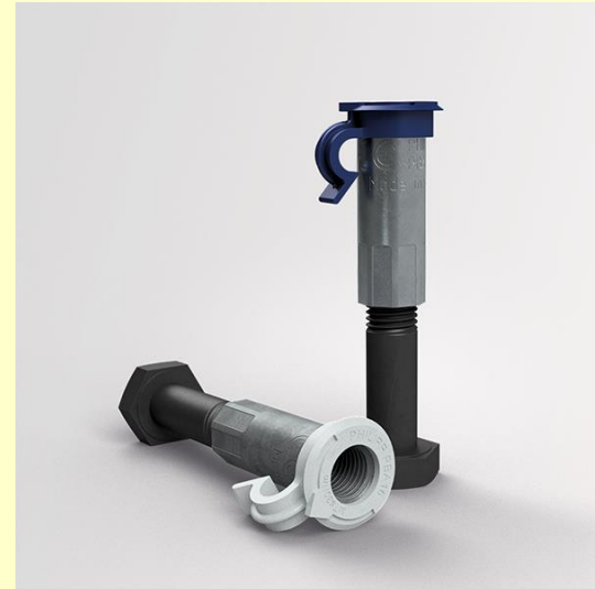
Philipp PB Anchor.

“While many things around us tend to become short lived, we are looking for a future that will last for generations to come.”