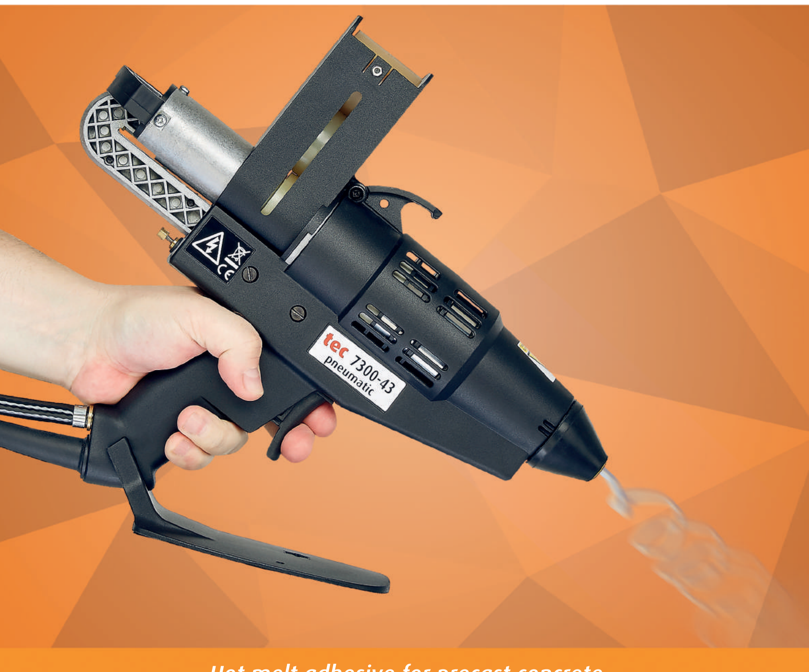
Hot melt adhesive for precast concrete